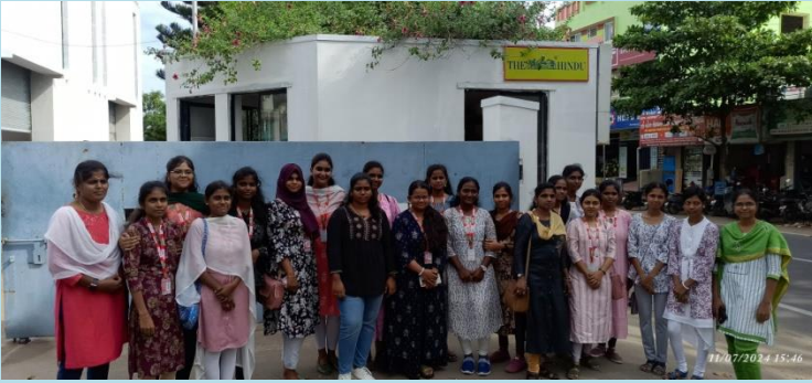
The Hindu, Coimbatore

A captivating One-Day Industrial Visit to The Hindu in Coimbatore was organized, offering participants an enriching opportunity to delve into the intricate art of newspaper creation. The visit provided invaluable insights into the dynamic world of journalism, from the meticulous editing process to the seamless production of the daily press.