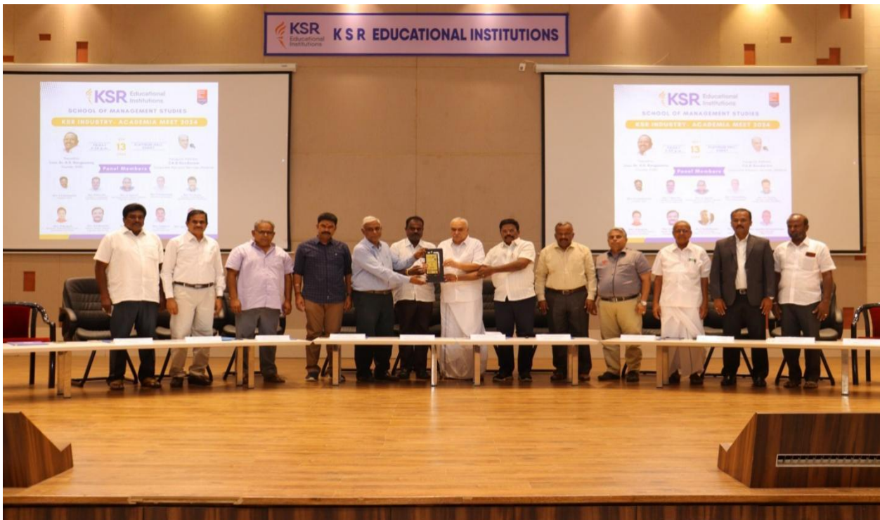
Students participation in the Meet